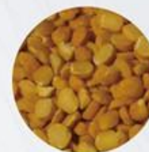
Peeled chick peas