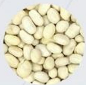
White kidney beans